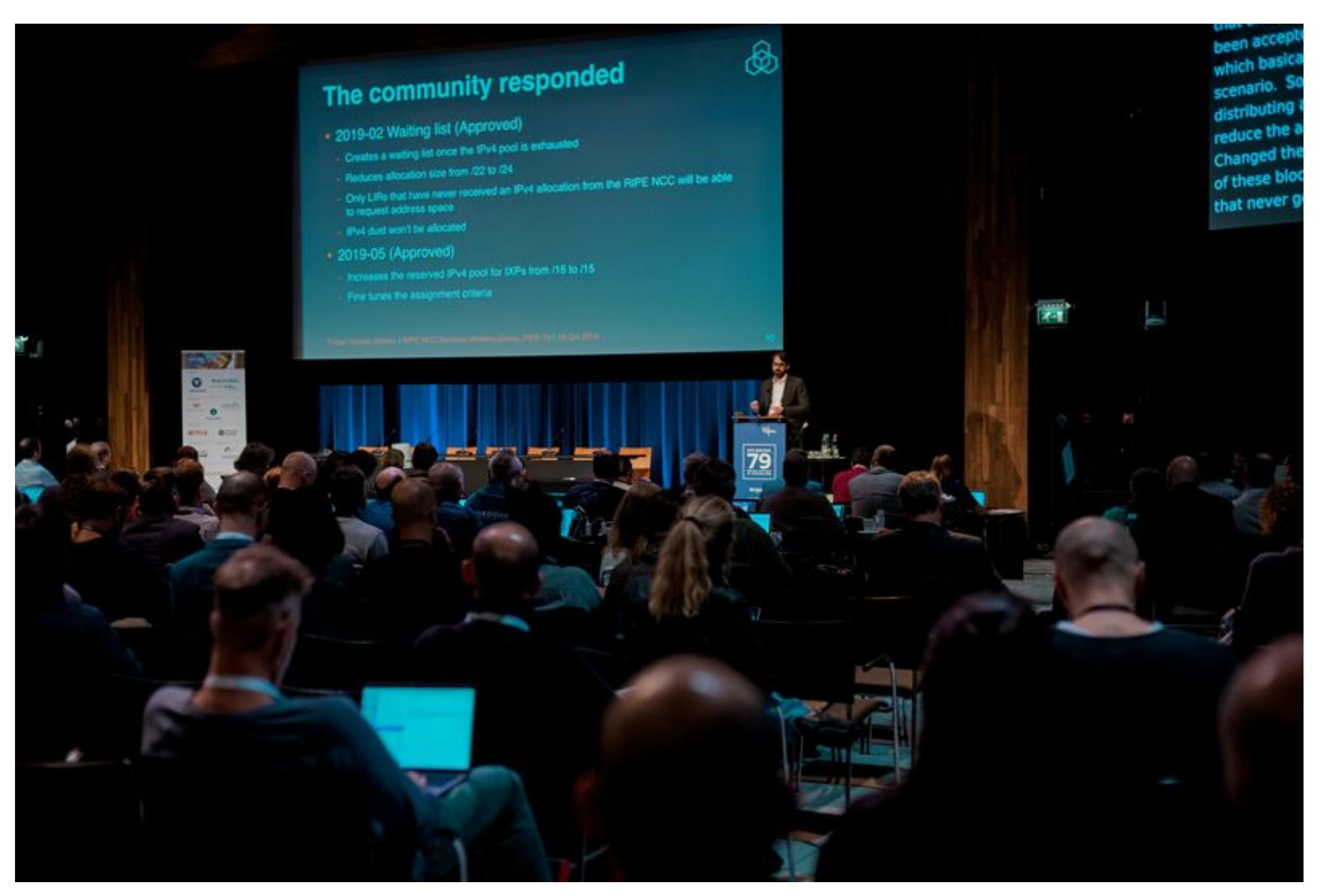
Felipe Victolla Silveira presenting on IPv4 run-out