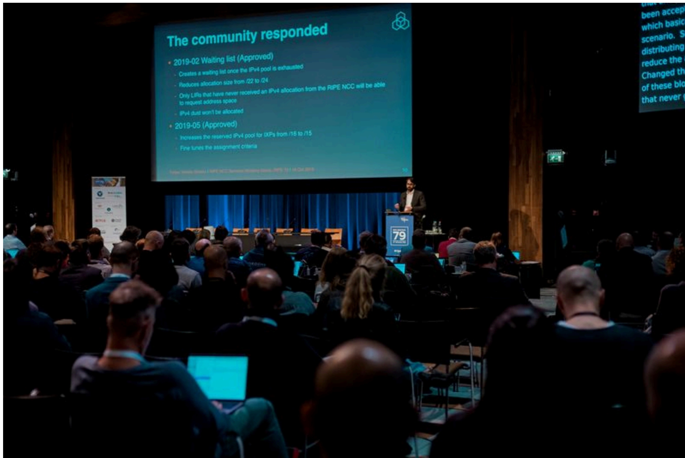
Felipe Victolla Silveira presenting on IPv4 run-out